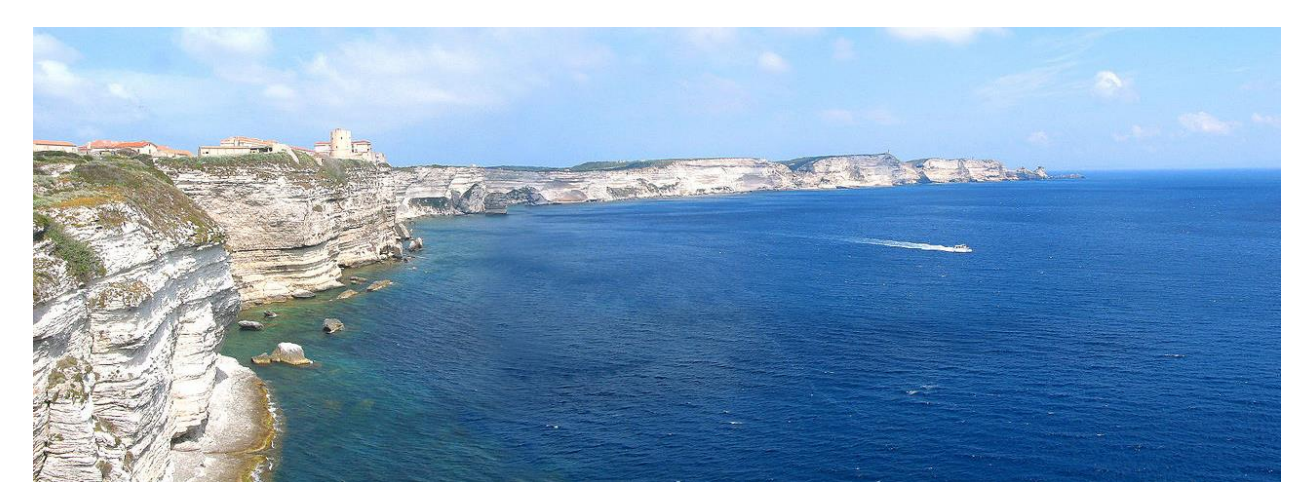
The Corsican town of Bonifacio, situated on cliffs overlooking the Mediterranean and Sardinia

Tel: (519) 753-2695/1-800-380-3974 - Fax: (519) 753-6376 tours@pauwelstravel.com — www.pauwelstravel.com